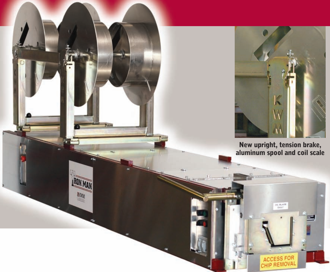
New upright, tension brake, aluminum spool and coil scale