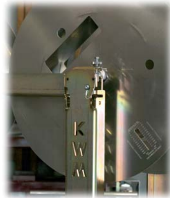
Innovative upright design reduces friction at upright wear-point